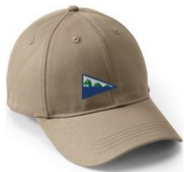
Twill baseball cap