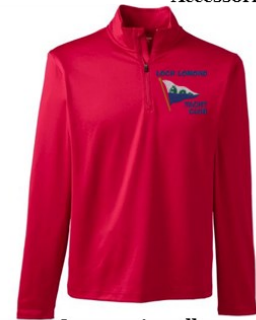
Quarter zip pullover